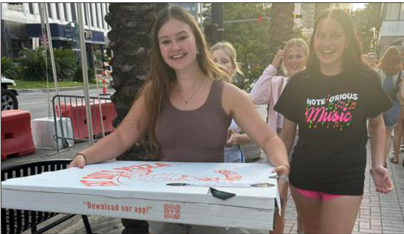
The Youth Group Made it to New Orleans for the National Youth Gathering in 2024.