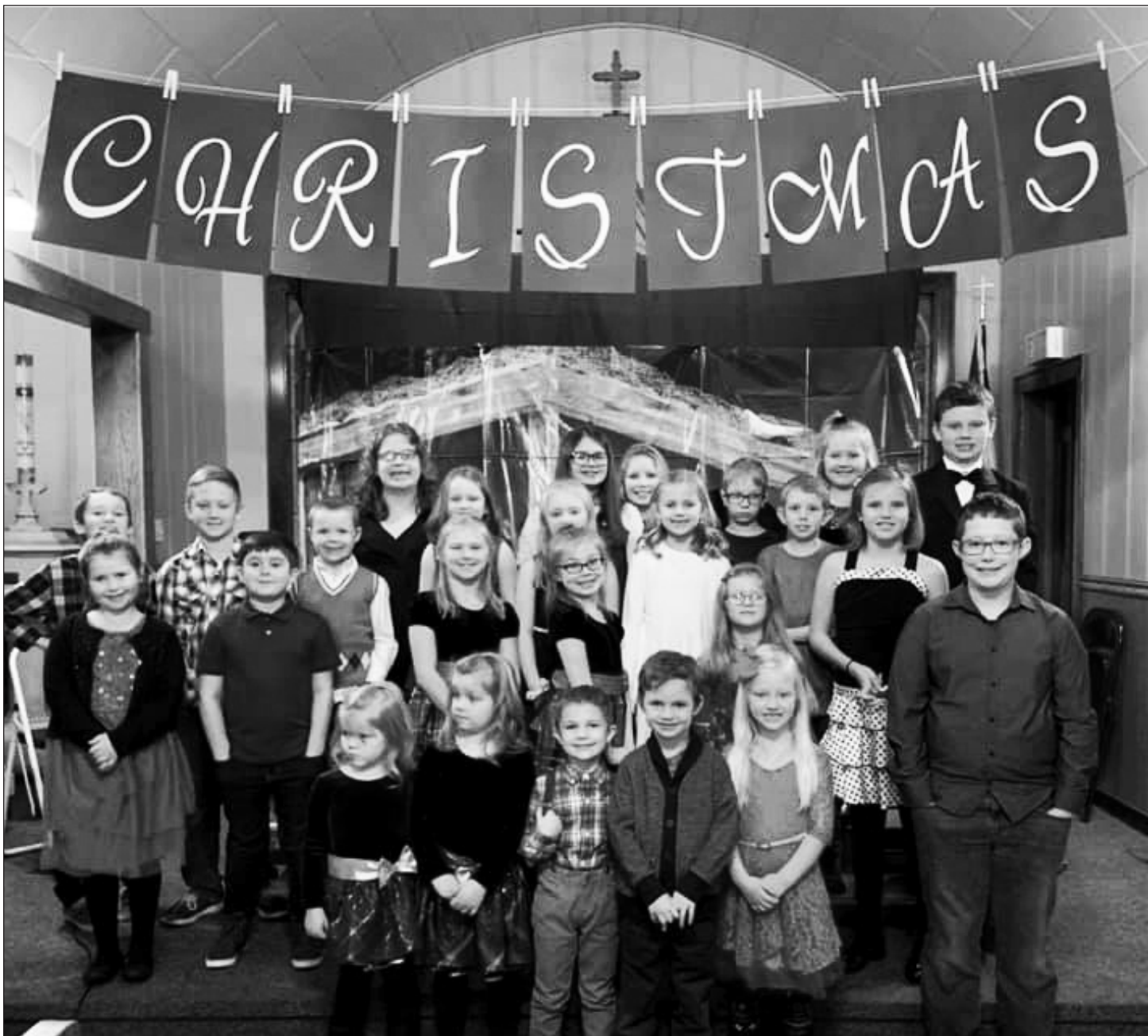
Salem's Sunday School Program December 15, 2019.