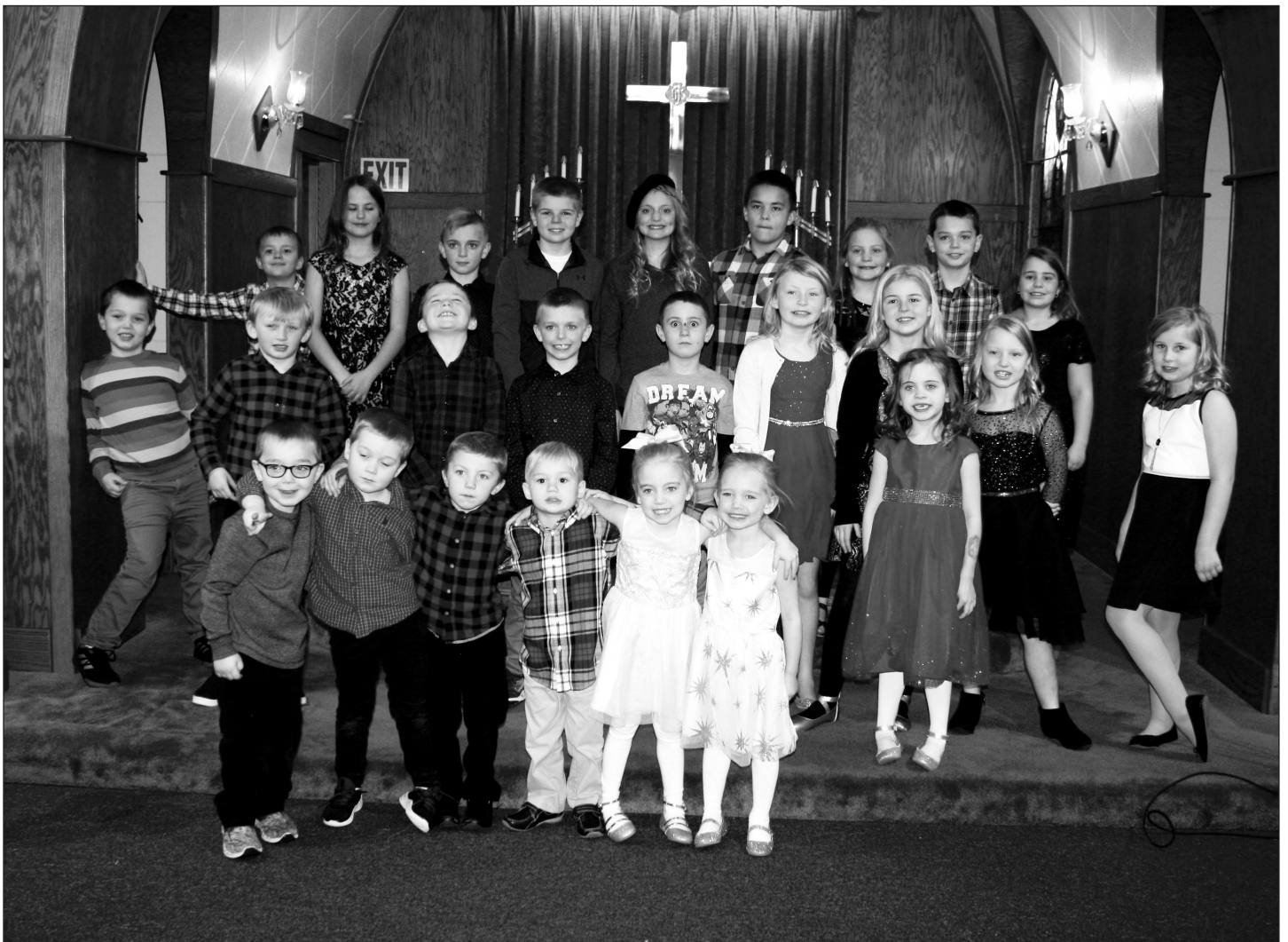
Zion's Sunday School Program December 15, 2019.